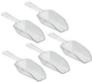
OUNONA 5pcs Mini Clear Plastic Kitchen Scoops/Ice Scoop , for

Plastic scoops for digging in snow (need to be plastic/not metal, but heavy duty). Ideally 4-6 per class (16 classes).