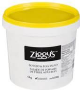
Ziggy's, Potato Egg Salad (5 kg)

Heavy plastic pails (one example shown below) for creating 'blocks' – to use for building in the snow. These need to be cleaned (obviously LOL). Again, ideally 4-6 per class (16 classes).